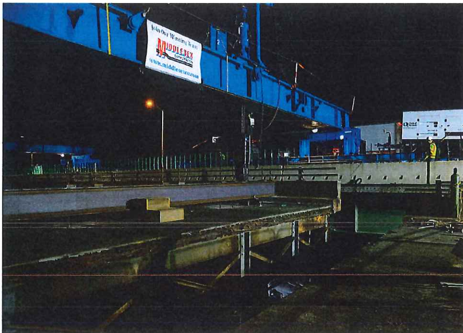
Existing Bridge Section being lifted away from adjacent span.