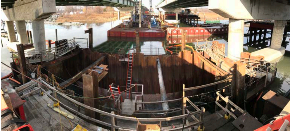
BR163 Pier 3 Cofferdam