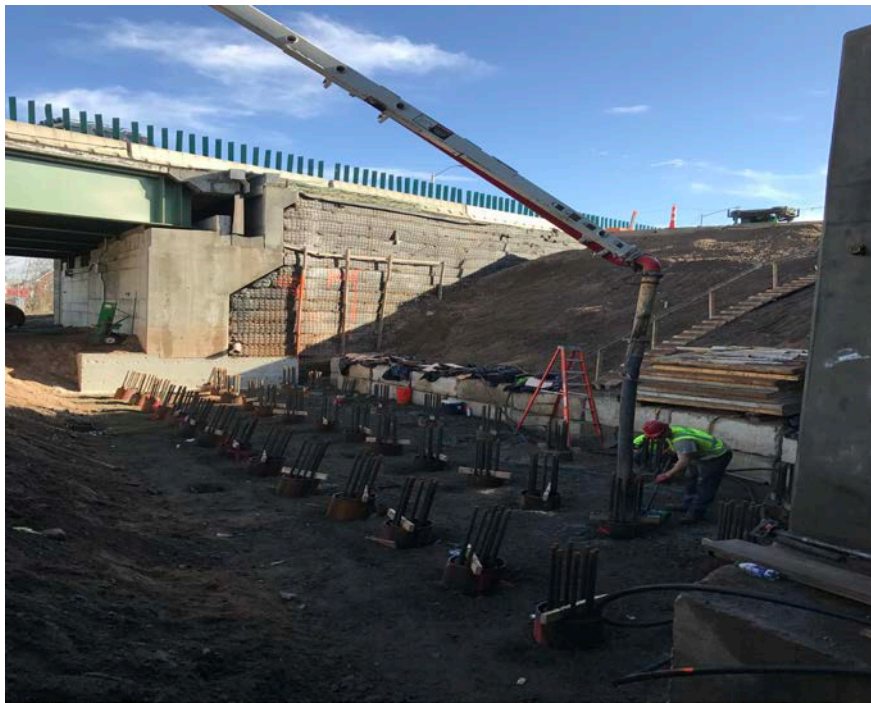
BR163 Abutment 2 Stage 3 Piles Being Grouted

Deer, bears and other wild animals become more populous in the spring, as the warmer weather brings animals out of hibernation. Be alert for wildlife in the road, and slow down so you can stop safely if animals are on or near the roadway.