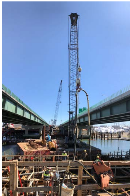
Pier 2 Grouting TaperTube Piles